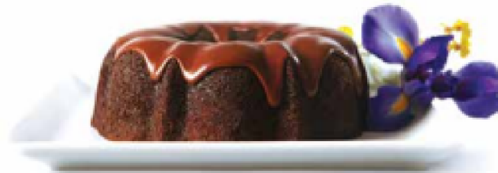
#102 - triple chocolate - $18 (34.6 oz.)

The Vanilla Rum cake has been Edda's signature flavor since the very beginning. The cake's rich buttery taste combined with the delicate blend of Vanilla and Rum remains a fan favorite. Once you've tried it, you'll understand why.