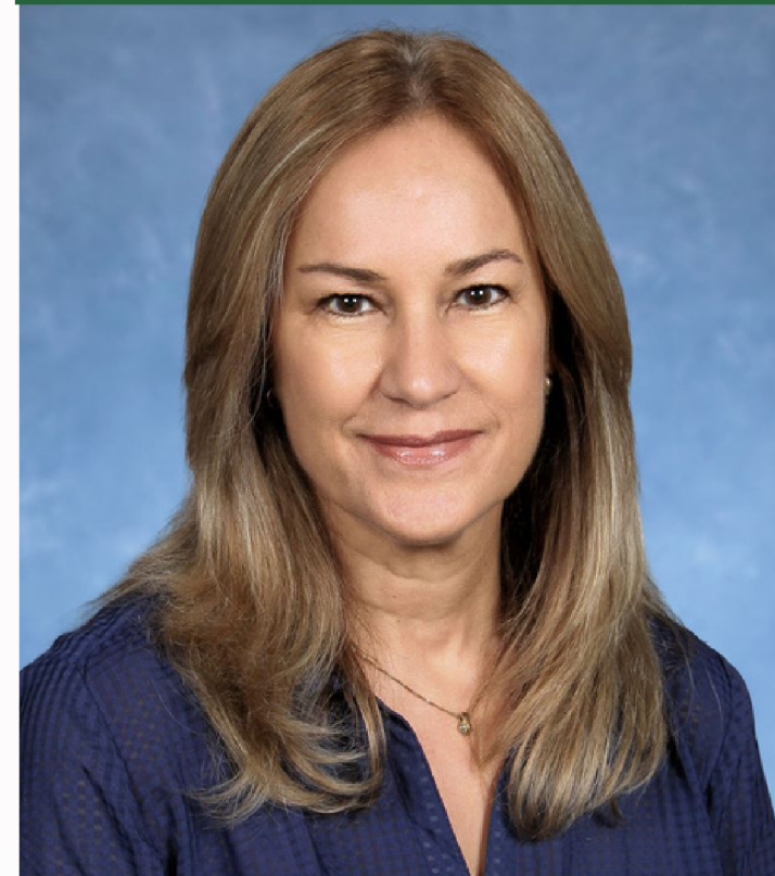
Senior Class Counselor