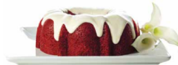
#104 - red velvet - $18 (29.6 oz.)

This guava cake has a robust tropical flavor that is perfectly paired with mouth watering cream cheese icing. A delicious combination that will seduce your taste buds and leave you craving for more.