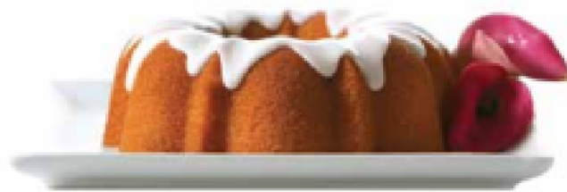
#101 - vanilla rum - $18 (31 oz.)