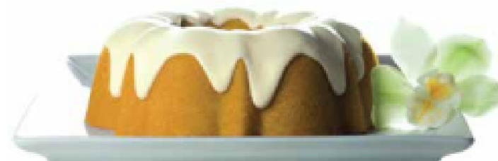
#105 - key lime - $18 (28.9 oz.)

The lovely combination of the rich and smooth cake with a hint of chocolate and the decadence of the cream cheese icing is what makes this Red Velvet cake so delightful.