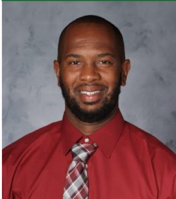
Assistant Principal over Seniors