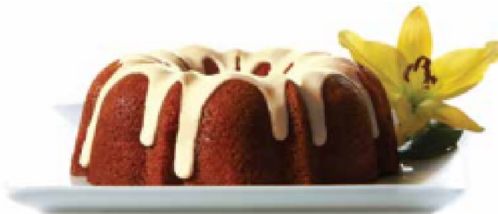
#103 - guava - $18 (28.9 oz.)

This deliciously extra-moist chocolate cake is loaded with chocolate chips and dripping with rich chocolate icing. It is sure to satisfy the chocolate lover in all of us.